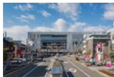
Providing Interpreter for the group of high level leaders of Yamashita Seikei Corporation - Japan