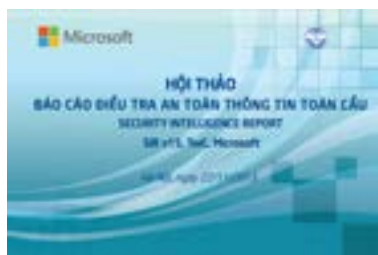
Providing Interpreter for the conference: Security Intelligence Report - SIR v15, TwC Microsoft