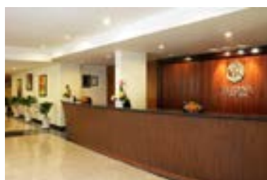
Providing Interpreter for The Second Sustainable Development Seminar or Postal Operators in Asia-Pacific countries