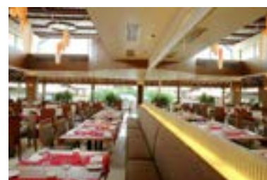
Providing Interpreter for Seminar on Sustainable Development of Tourism Destination